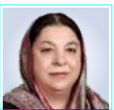
Yasmin Rashid Pakistan